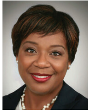
Mayor Annette Blackwell City of Maple Heights