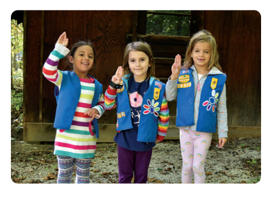
Photos above were taken at Camp Ledgewood's 90th Anniversary Celebration on October 2, 2022.