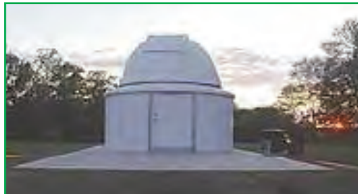
Observatory at Camp Timberlane in Wakeman.

"Having the observatory is a fantastic way to expose girls to science, technology, engineering and math (STEM)," said GSNEO