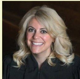
Judge Joy Malek Oldfield Summit County Court of Common Pleas, General Division