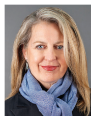
State Senator Kristina Roegner Ohio State Senator for Ohio Senate District 27