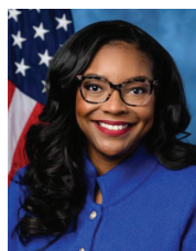
Congresswoman Emilia Sykes U.S. House of Representatives