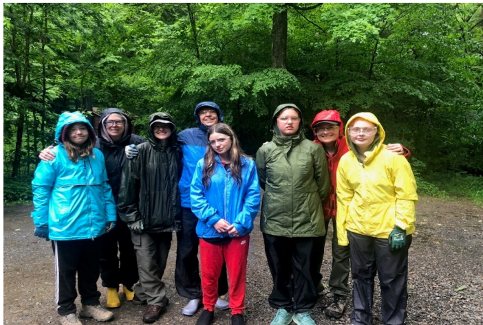
Service Project Alleghany National Forest June 2023.