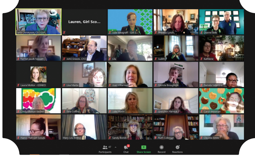
Virtual Planned Giving Event